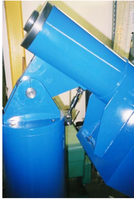
Elevation & Azimuth Adjustment