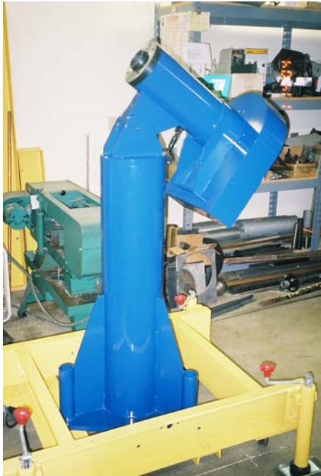
Polar Axis Assembly & Pier