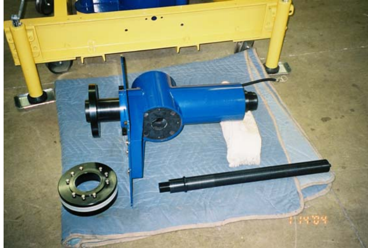
Declination Housing with Shafting and Slip Clutch