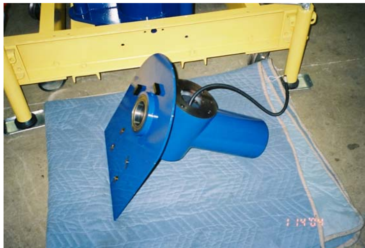
Declination Housing Weldment