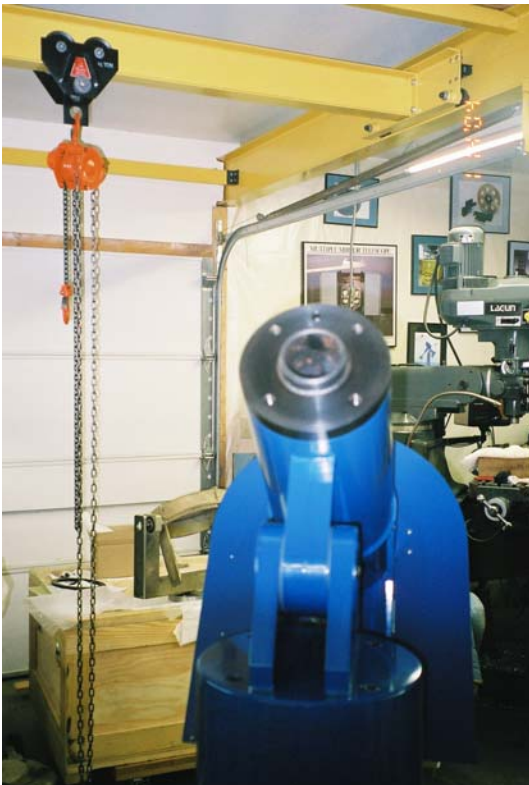
Mounting Flange for Declination Housing