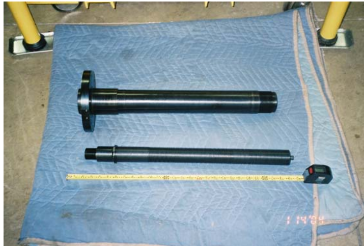
Declination Shaft – two piece assembly (acme thread for counterweights)